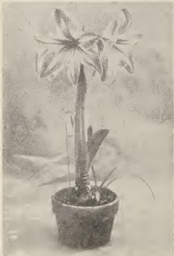
Good & Reese Giant Amaryllis Hybrids

For the past eight years we have been selecting the best giant flowering Amaryllis from thousands of choice seedlings. These are now offered for the first time in blooming size bulbs of the most beautiful colorings.